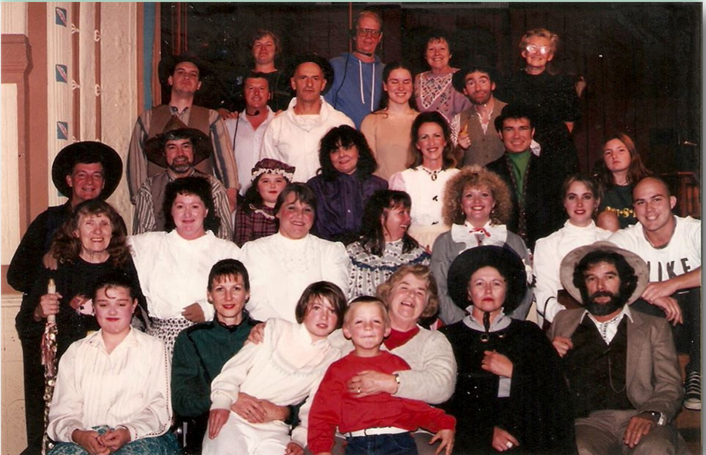
'The Villain was a Lady' - 1997 (Who do you recognise?)